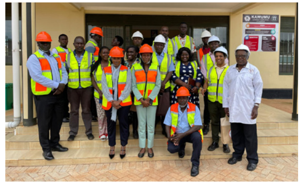
▲ CBC Touring Kawumu Leather Industry in Uganda during a Membership Drive.