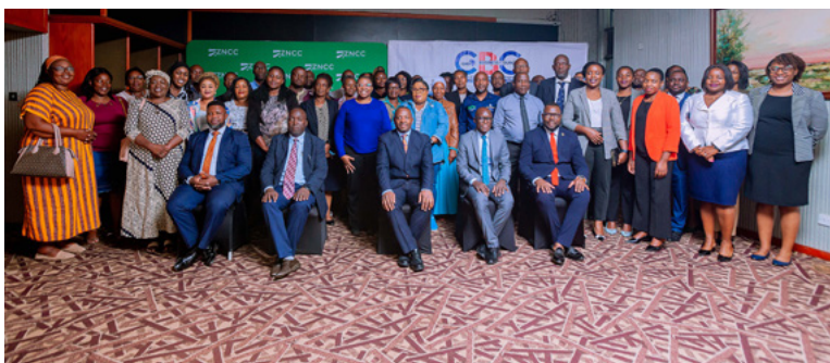
▲ CBC-in partnership with ZNCC during the hosting of the BizNet Workshop in Zimbabwe