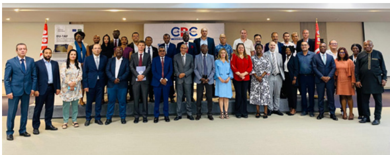
◀ Workshop held in Tunisia on AfCFTA targeting the COMESA Francophone countries.