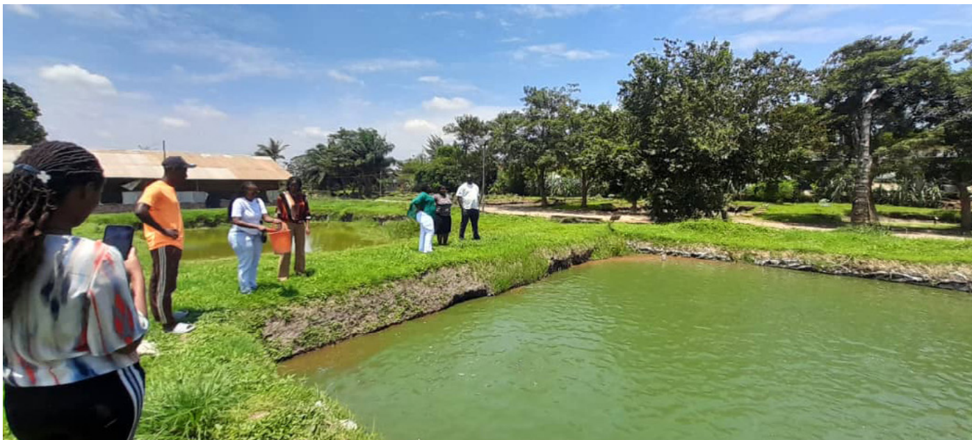
Gudie Leisure Farm fishpond.