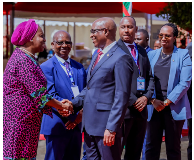
▲ COMESA SG and CBC President (centre) welcoming Burundi's Prime Minister during the 17th COMESA Business Forum.