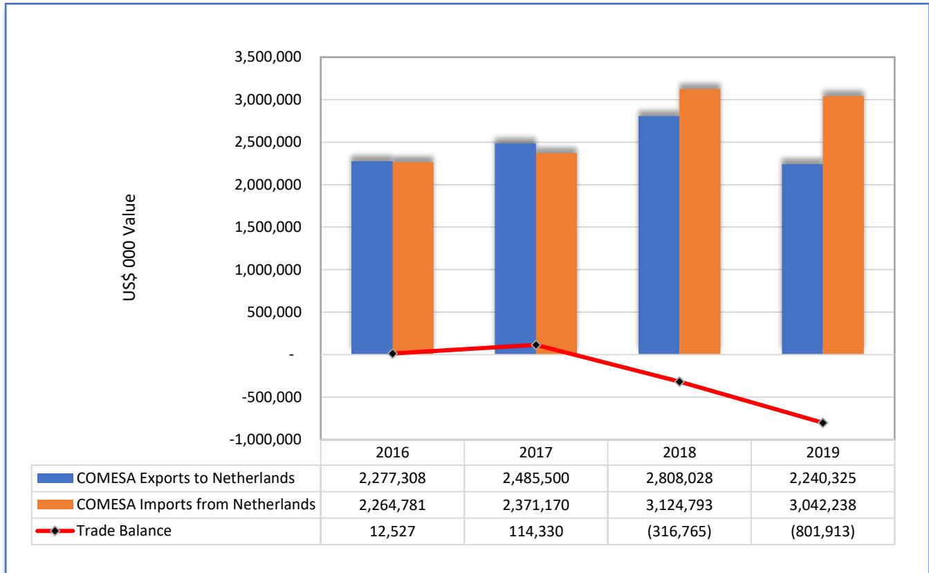
Chart 3: COMESA-Netherlands Trade Trend: 2015 – 2019

The chart below highlights the bilateral trade trend between COMESA and Netherlands.