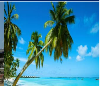
Strong Trade Ties

30 Days to GO!! COME and Dialogue with Renowned Industry Doyens at COMESA – Connect-Industry Dialogue